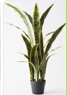
Sanseveria - Mother in Law Tongue