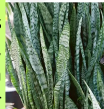
Mother-in-Laws Tongue Zeylanica