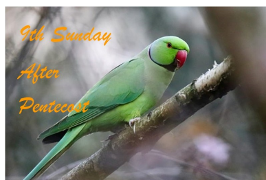
9th Sunday After Pentecost