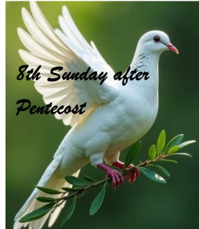
8th Sunday after Pentecost

Children are very welcome at St. Matthew's and that means their noise is welcome too. This room is here if you feel the need to step out of the service or would like some more privacy but still want to see and hear what's going on in the service. OPEN FROM 9AM