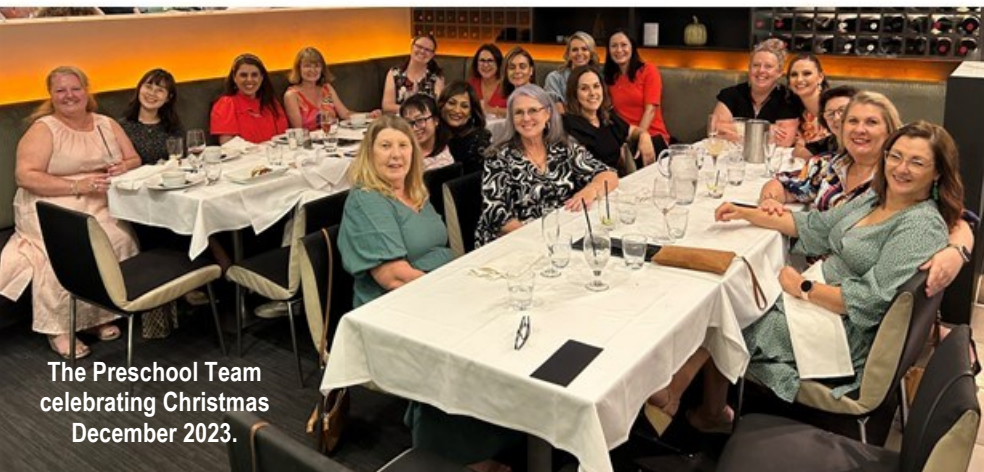
The Preschool Team celebrating Christmas December 2023.

Over the next 12 months we plan to do some playground upgrades, and continue to build our reserves & our connection between the church and preschool.