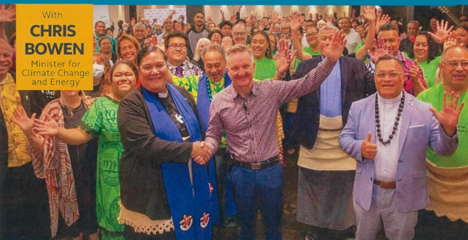
With CHRIS BOWEN Minister for Climate Change and Energy

A Community Event for Climate Justice and Cost of Living