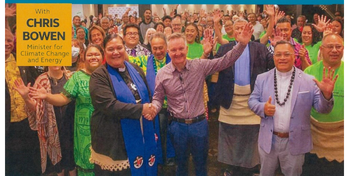
With CHRIS BOWEN Minister for Climate Change and Energy

A Community Event for Climate Justice and Cost of Living